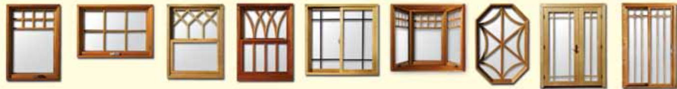
Hurd aluminum clad wood, all-wood, and Hurd FeelSafe™ windows and patio doors—plus our advanced new H3™ windows—are protected to the core by CoreGuard.